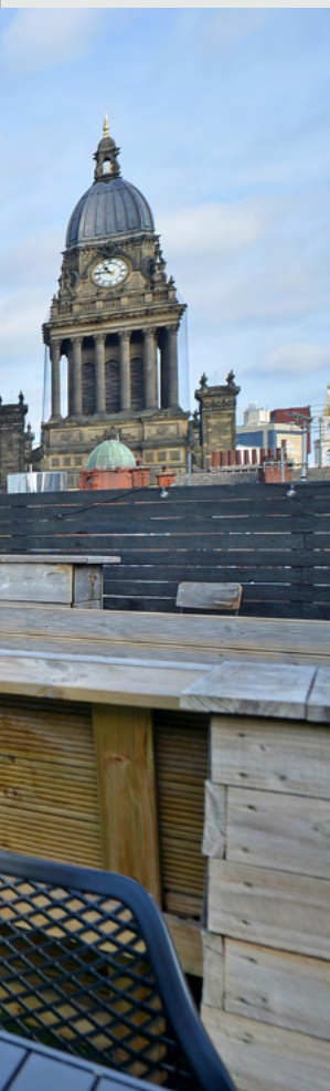
↓ LA BOTTEGA