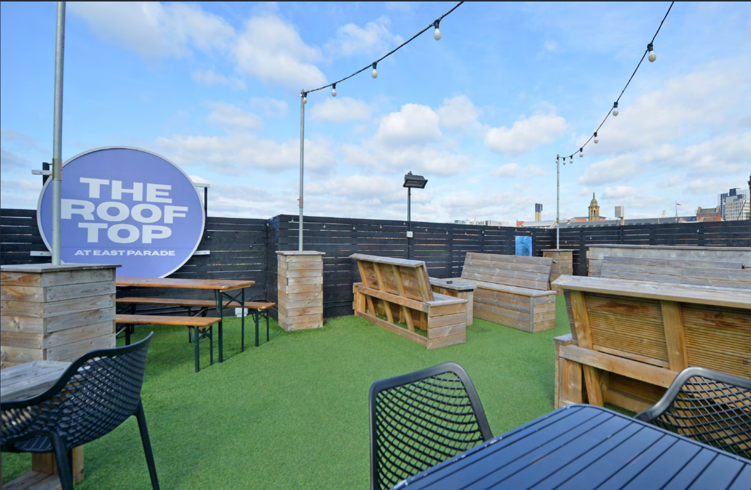
↑ THE ROOF TOP AT EAST PARADE